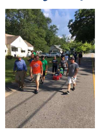
Walk with your Local Elected Official

The City of Greer Parks and Recreation Department is committed to fulfilling our mission of providing quality recreational experiences while administering the values of community image, human development, preservation of environmental resources, health and wellness, economic development and cultural unity.