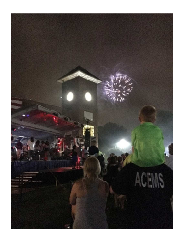
Freedom Blast 2017

The City of Greer Parks and Recreation Department is committed to fulfilling our mission of providing quality recreational experiences while administering the values of community image, human development, preservation of environmental resources, health and wellness, economic development and cultural unity.