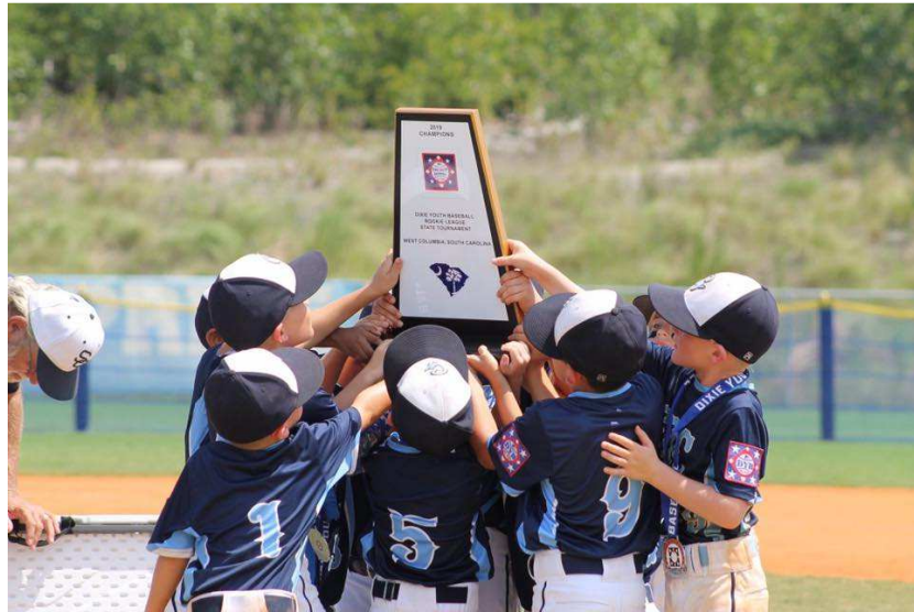
Greer Recreation's 6U All-Star team won the Dixie Youth South Carolina State Championship.

"Creating Community through People, Parks and Programs"