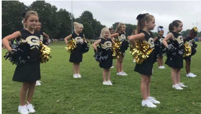
Cheer for Greer began practices in August at Greer City Stadium.

"Creating Community through People, Parks and Programs"